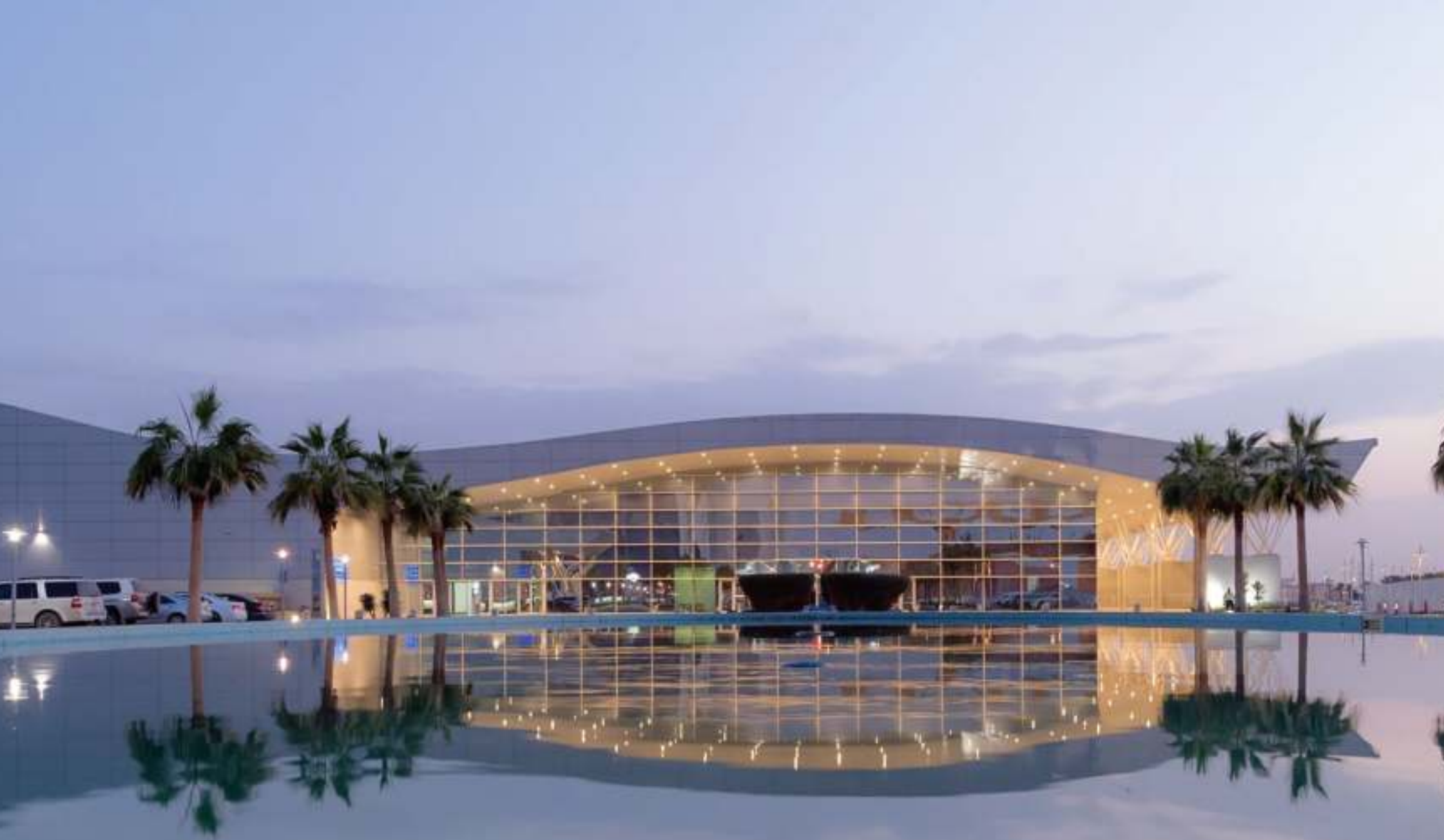
Riyadh International Convention & Exhibition Center